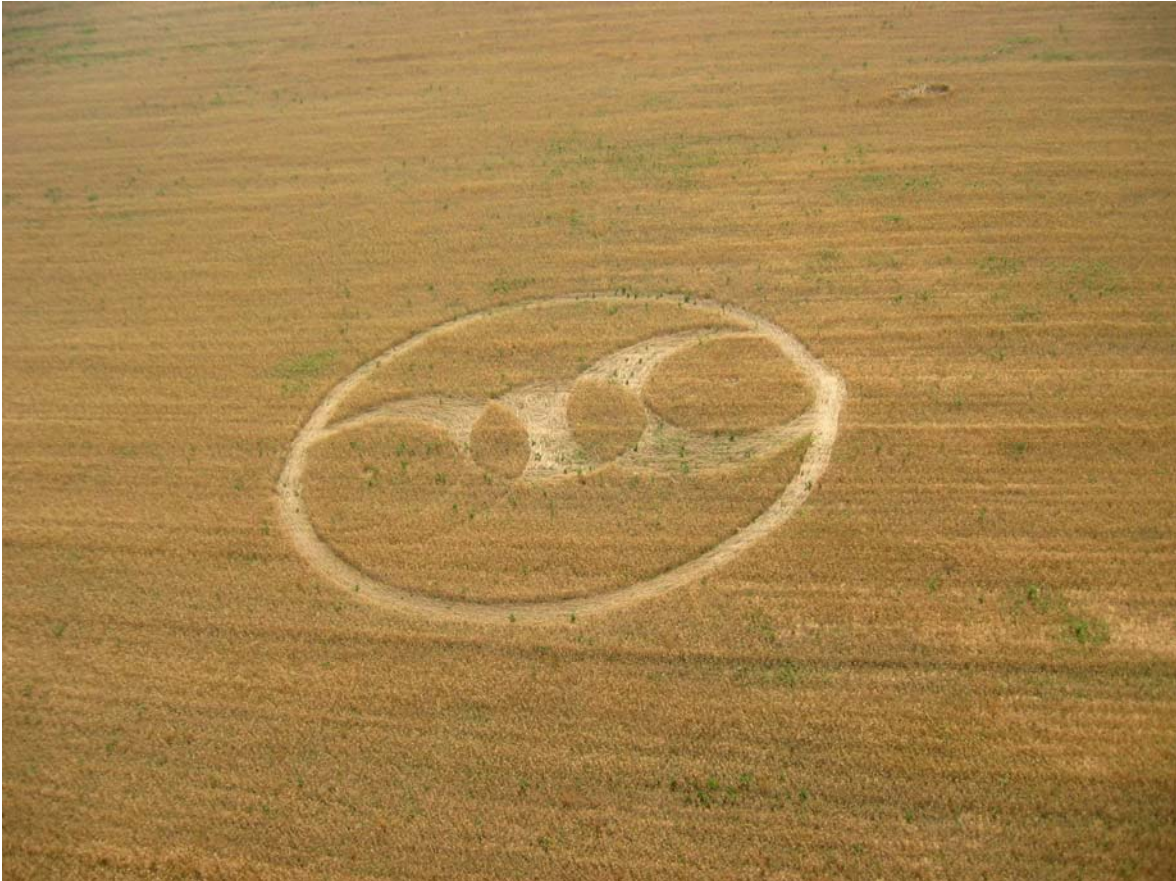
June 14, 2007 – New NE Arkansas Crop Circle