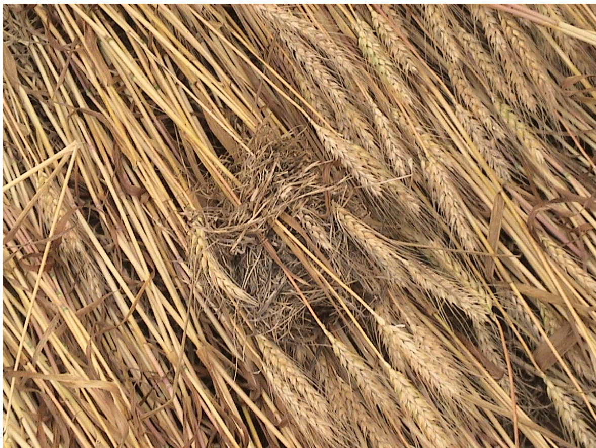
May 24, 2004: Peach Orchard "pinwheel" formation w/intact bird's nest in flattened crop.